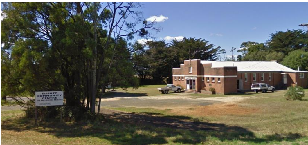
Elliott Community Centre